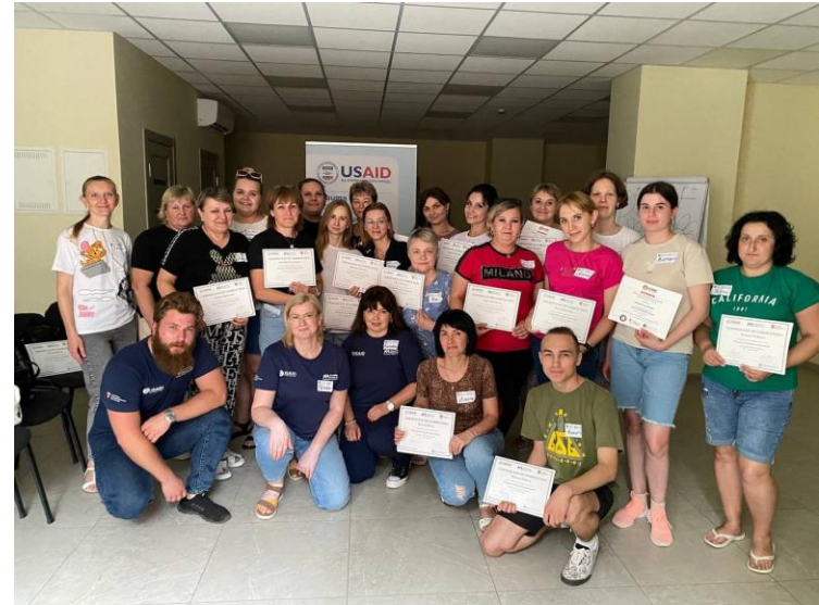
Our ToT instructors are back to Dnipro, 2024