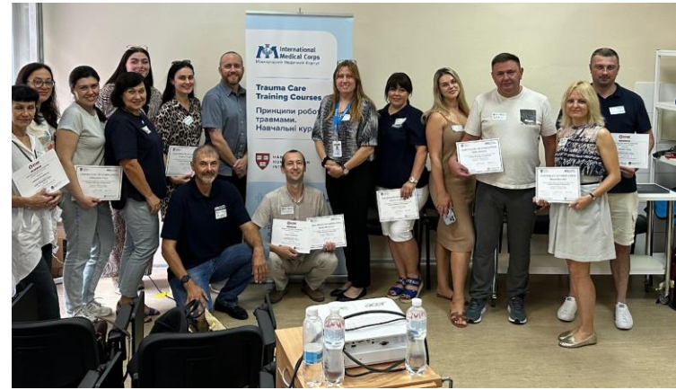
ToT in Dnipro, 2023

The ToT courses and observed training sessions commenced on August 28th at Dnipro State Medical University