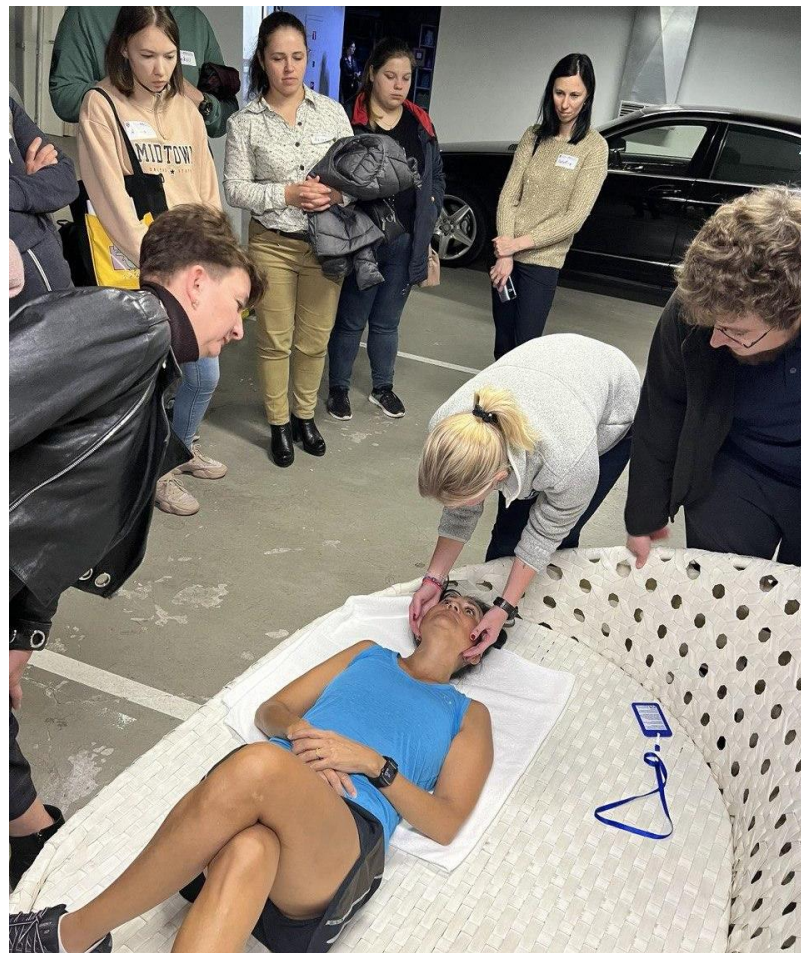
Continuation of training in a bomb shelter, Zaporizhzhia 2022